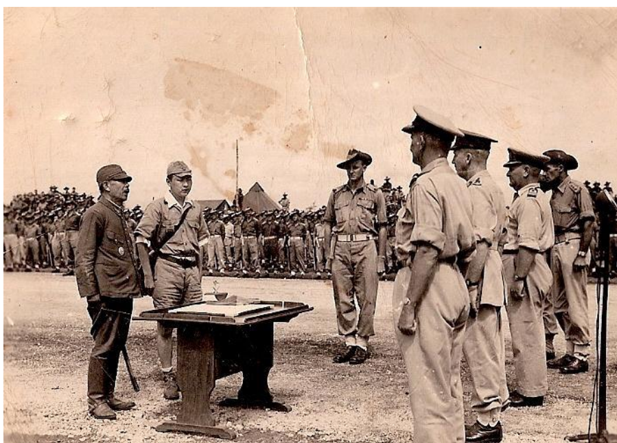
Japanese Lieutenant General Hatazō Adachi, commander in chief of the 18th Army on Rabaul and the north coast of New Guinea, surrendering to Major General Horace Robertson, GOC 6 Australian Division at Cape Wom airfield, by Wewak, New Guinea, 13 September 1945

On 7 December 1941 the US Navy based at Pearl Harbour, Hawaii, came under attack by the Japanese and thus brought the United States of America into conflict across the Pacific.