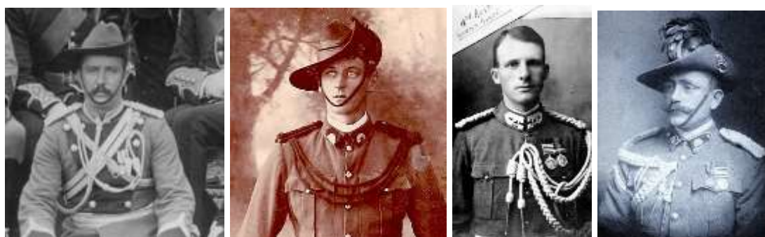
Members of the 1902 Australian Coronation Contingent for King Edward VII

Visit the Australian Army Museum of Western Australia web site https://armymuseumwa.com.au/