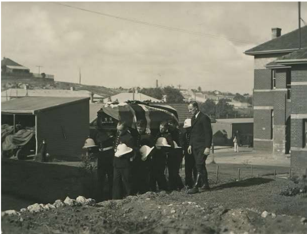
Coffin of General Hobbs leaving Artillery Barracks, morning of 14 May 1938

https://anzacportal.dva.gov.au/wars-and-missions/ww1/politics/repatriation