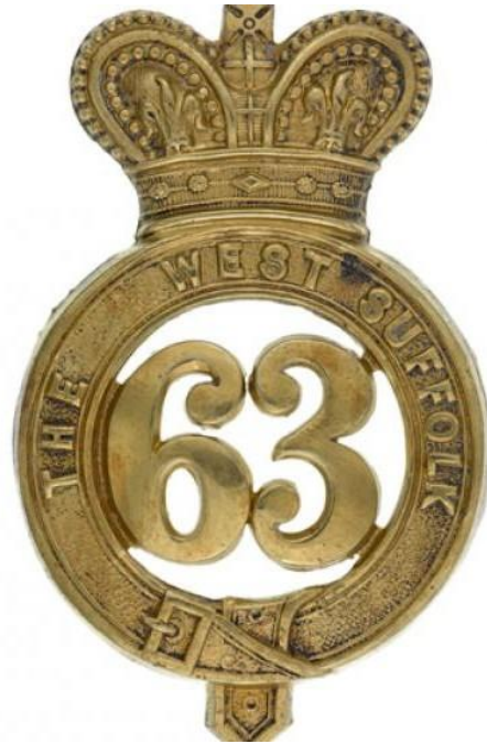
(R) Helmet plate of 63 rd West Suffolk Regiment of Foot