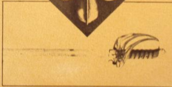
A Short History of 63rd of Foot in Western Australia 1829 – 1833 by Walter Dennison and Paul Godden, 1978 [Note the inverted Manchester Regiment badge] https://www.iwm.org.uk/collections/item/object/30076432